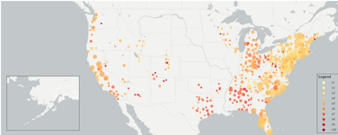
Figure 2 : This chart shows churn scores by pre-identified regions (1-2, 2-3, 3-4, etc.)

Darker colors signal higher median churn scores. Larger bubbles signal more customers in the zip code